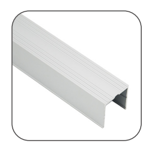
Alu Profile (Back)